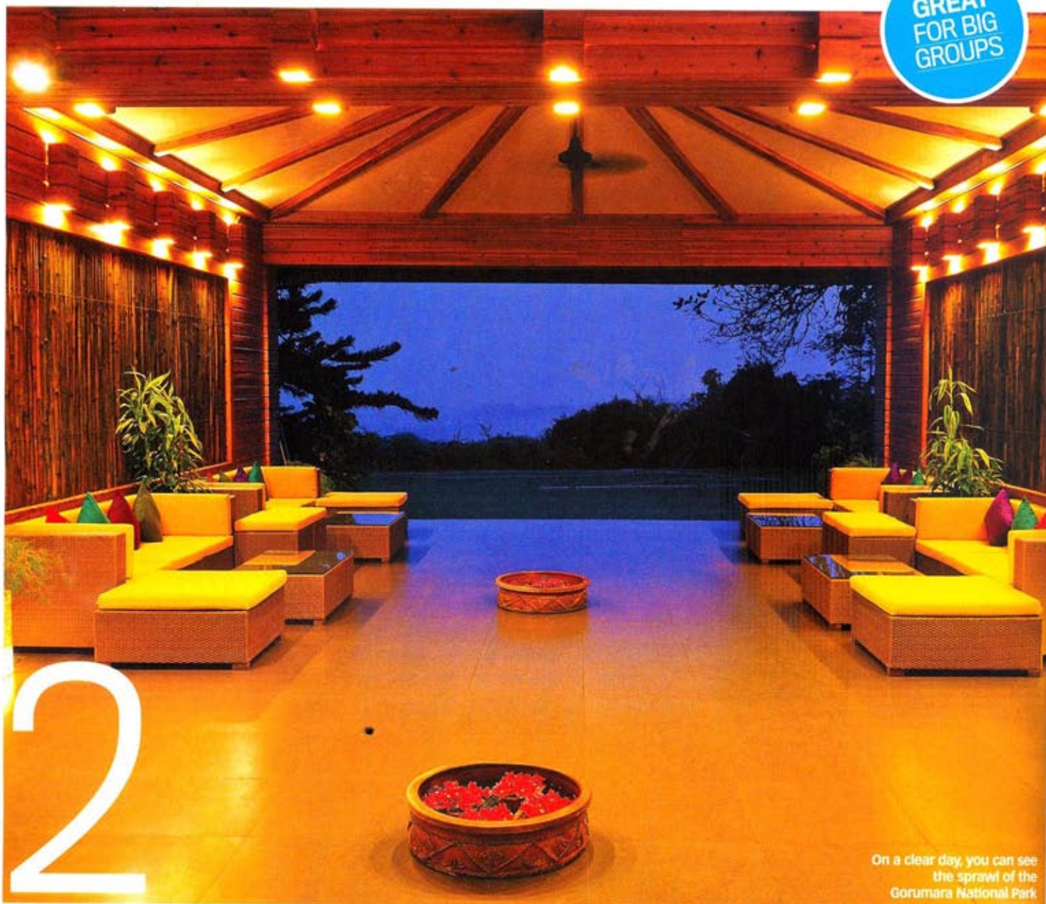
On a clear day, you can see the sprawl of the Gorumara National Park