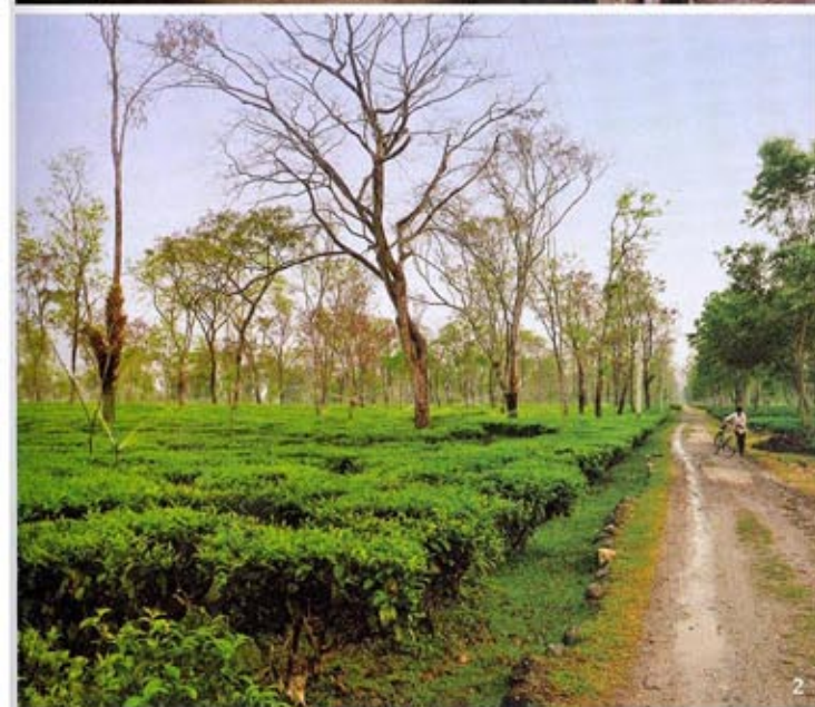
1. Hot momos make for a quick, satisfying treat 2. Some tea estates in and around Chalsa are on flat ground, not terraced slopes 3. If nothing else, you will meet lots of peacocks in Gorumara Below: Thukpa is a common breakfast dish in this region