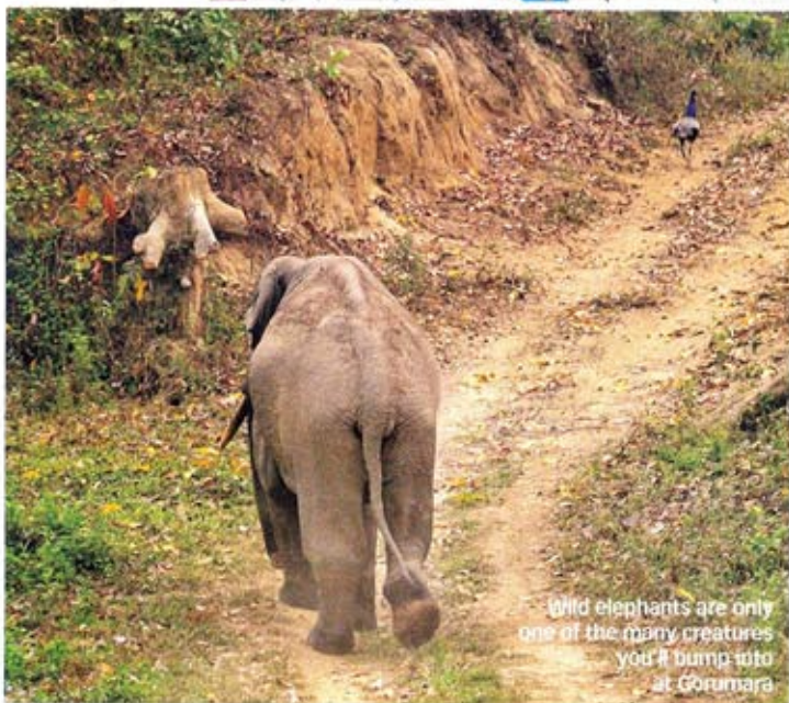
Wild elephants are only one of the many creatures you'll bump into at Gorumara